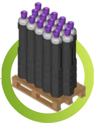
The cylinders can be carried on standart european pallets. 15 SCC cylinders per pallet.