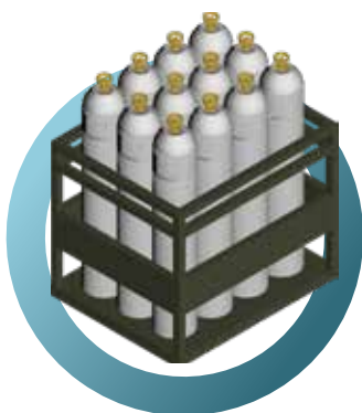
Steel cylinders must travel in cages, so they need more space in the truck.

Although space allows us to fit 33 pallets, the weight limit of 24 tons permits us to charge just 31 pallets.